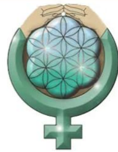
GTW-Logo Full Color